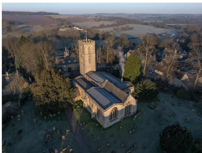
St Mary's from above