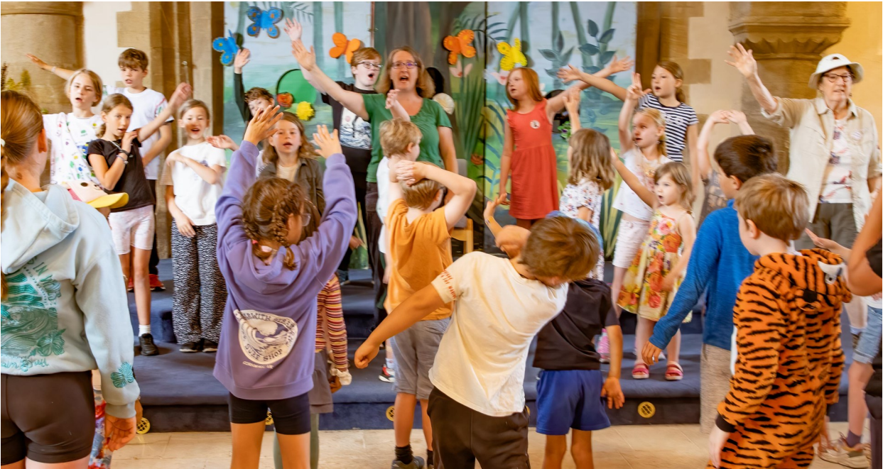
CTC Holiday Club

The special service on the Sunday was an opportunity for all ages - parents, grandparents, carers, friends and our regular congregations - to share in what the children had been doing during the week.