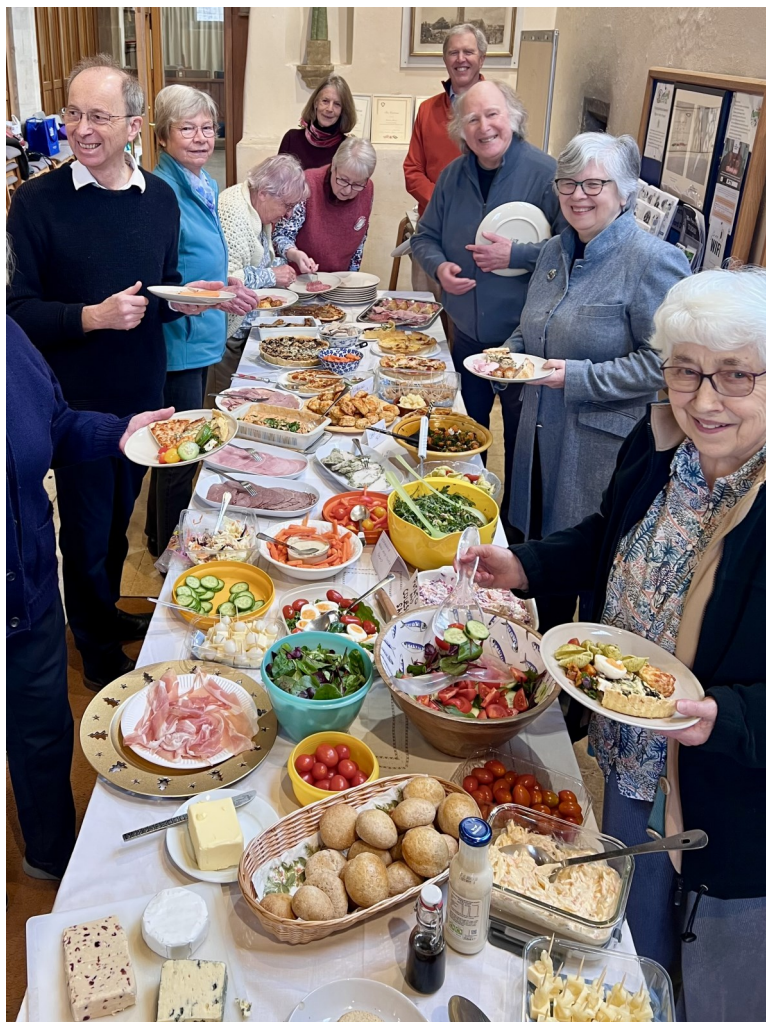
Community Lunch for Candlemas

Thanks is also due to all the wonderful people - too many for me to name! - who enable, support and sustain our ministry. You will read about joy giving and life sustaining activities of every possible sort: each of those has a committed set of wonderful volunteers behind them. I want to take this opportunity to thank them and to tentatively - if you're reading this and aren't involved - invite you to join them.