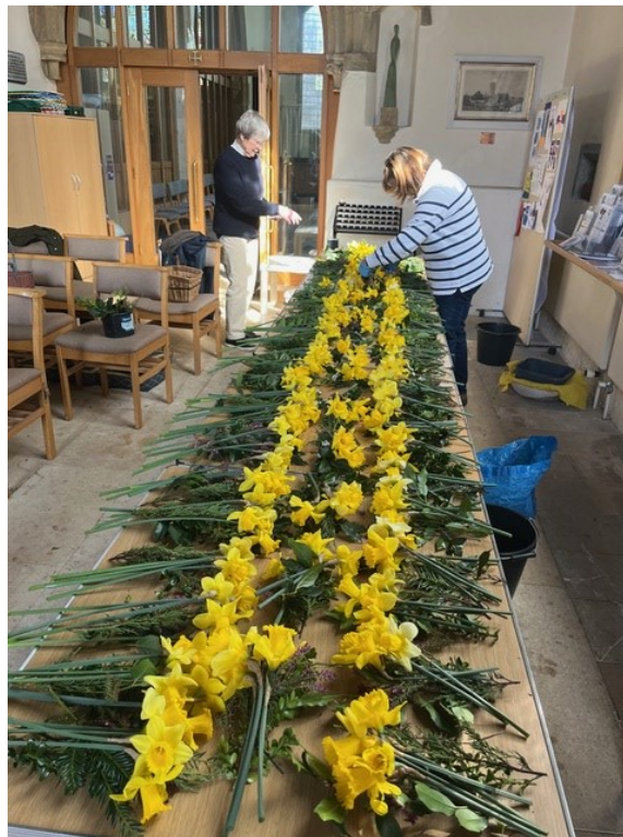
Mothering Sunday Flowers in St Mary's Church

The PCC is a body corporate (PCC Powers Measure 1956, Church Representation Rules 2006) and Charlbury with Shorthampton is registered with the Charity Commission. Registered Charity Number: 1193530.