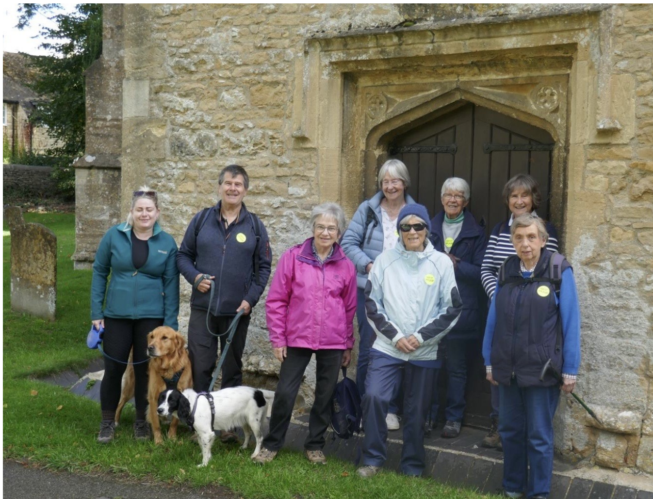
Ride and Stride walkers and helpers