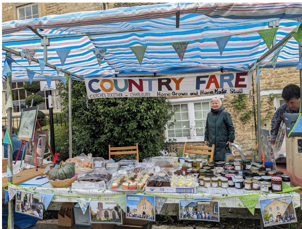
Churches Together Stall at Street Fair