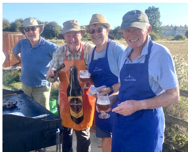
Cricket Fundraiser & BBQ