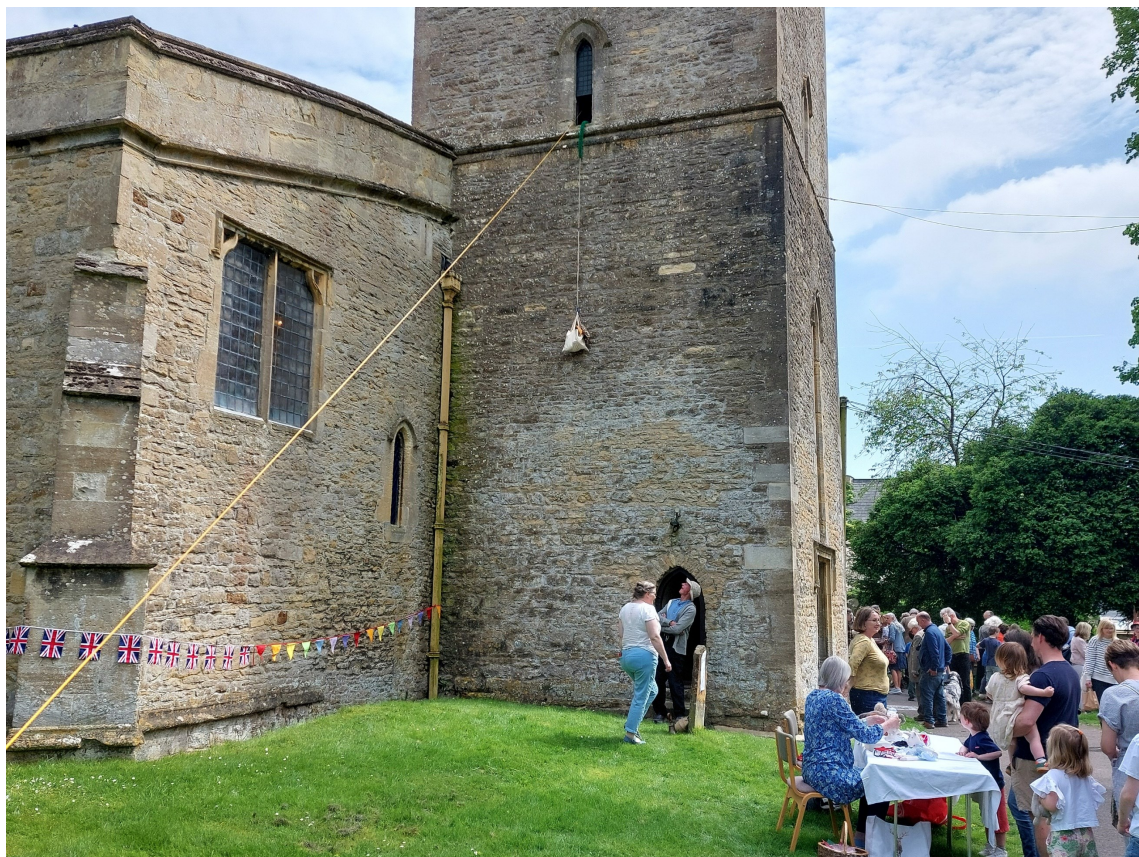
Teddy zipwire from the bell tower.