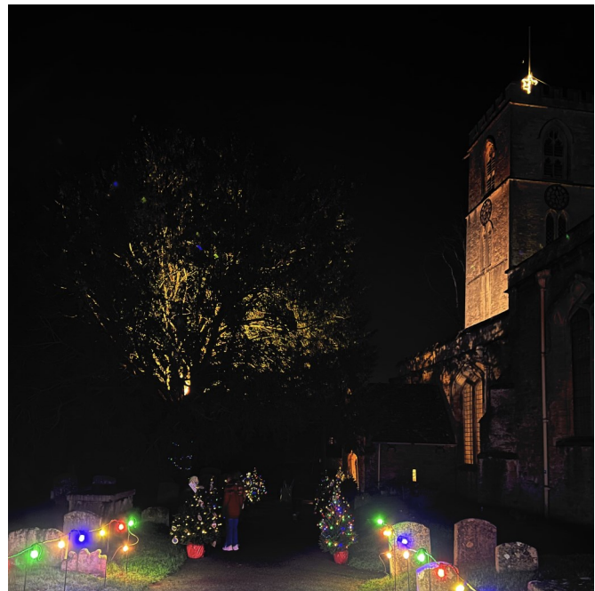
Christmas Tree Festival