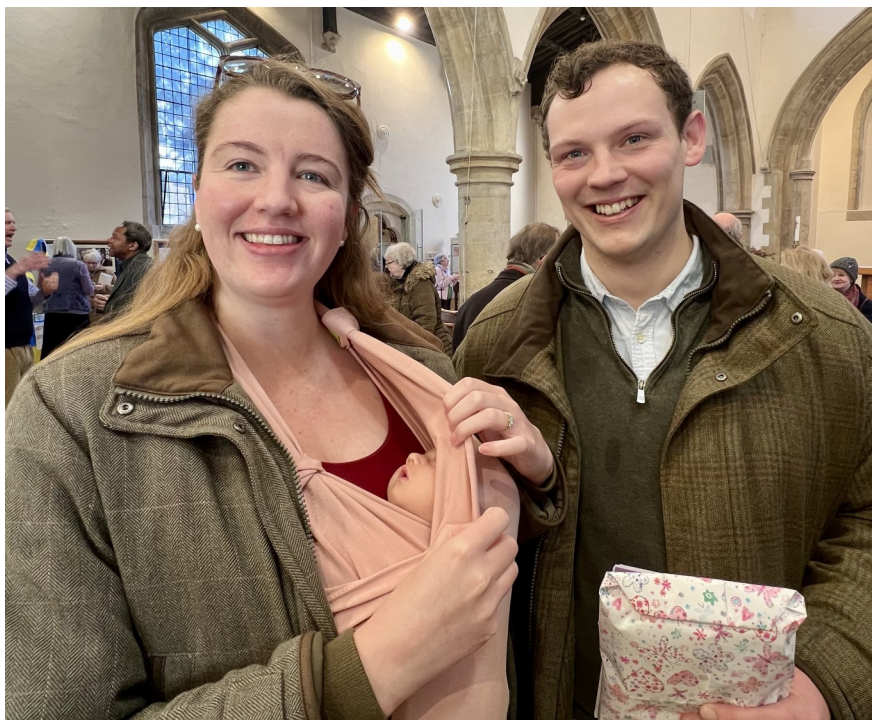
The Newest Member of the congregation

We continue to be an essential part of the wider life of the town of Charlbury - from the Beer Festival to the Fete to the hosting of our new monthly soup lunches - I am immensely grateful for all those who make such opportunities, however small, to show the love of Christ to our neighbours.