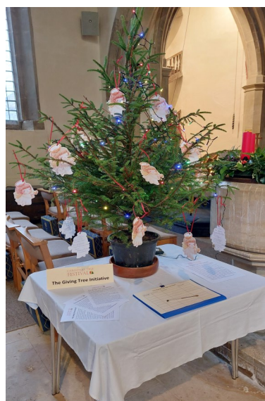
Giving Tree Initiative