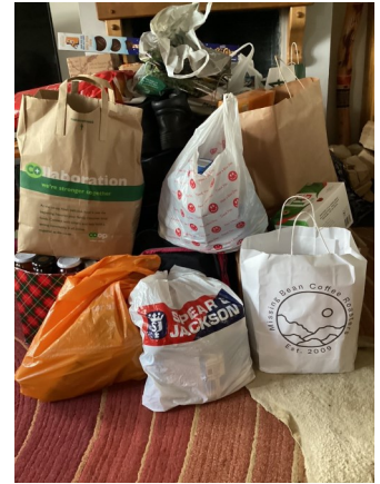
Donations for the Porch

In Advent St Mary's and Cornerstone acted as collection points for donations to the Reverse Advent Calendar, when instead of receiving sweets or other gifts from an advent calendar on the days leading up to Christmas, we put aside food and other useful items to be taken to the Porch day centre in Oxford in the new year.